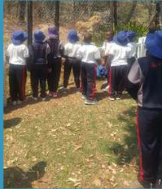
WATCHING THE KING OF THE JUNGLE!