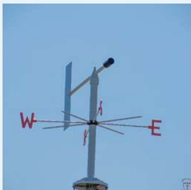
The wind vane which is used to measure wind direction