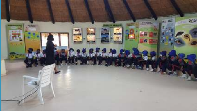
THE GRADE 4 BLUE LEARNERS DURING A DISCUSSION ON THE IMPORTANCE OF CONSERVATION LED BY ONE OF THE LION PARK STAFF MEMBERS.