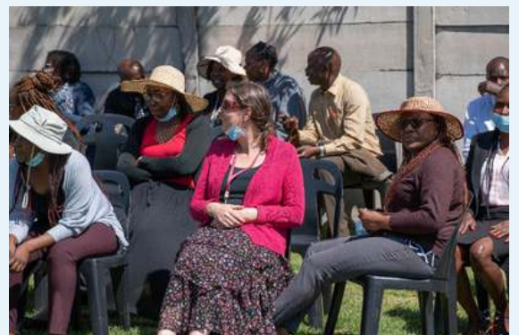
Staff members paying attention during the training session

A week later staff from the Meteorological Station (Met Station) of Harare visited Gateway and trained a few staff on how to use a rain gauge to record rainfall figures.